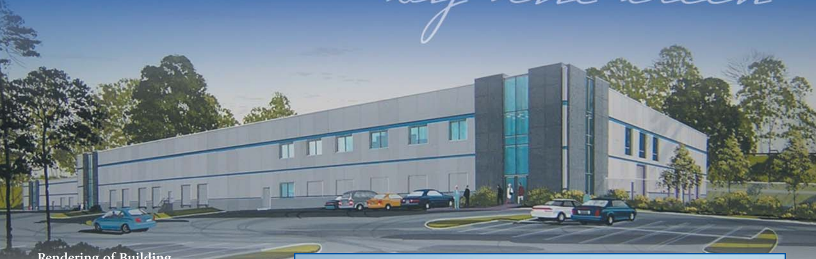
Rendering of Building

Industrial Units for Sale from 15,000 sq. ft. to 42,500 sq. ft.