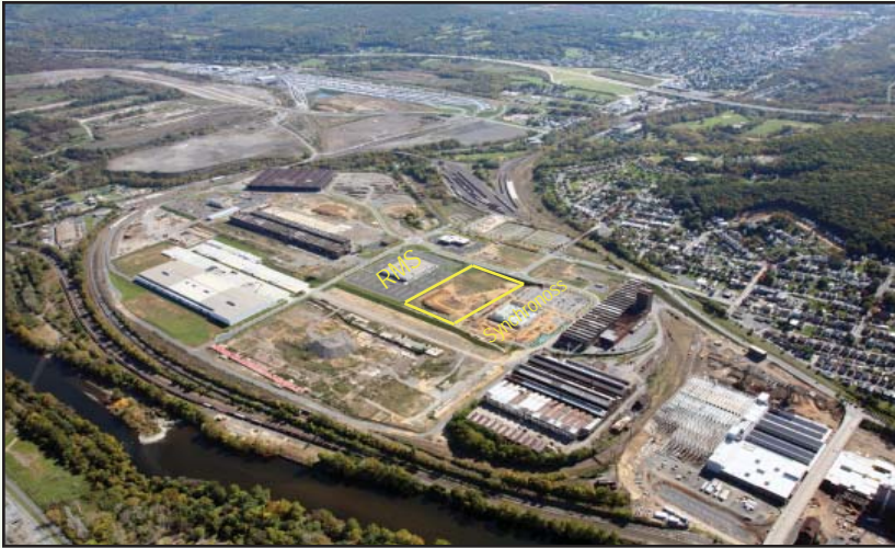
1645 Spillman Drive, Bethlehem, PA