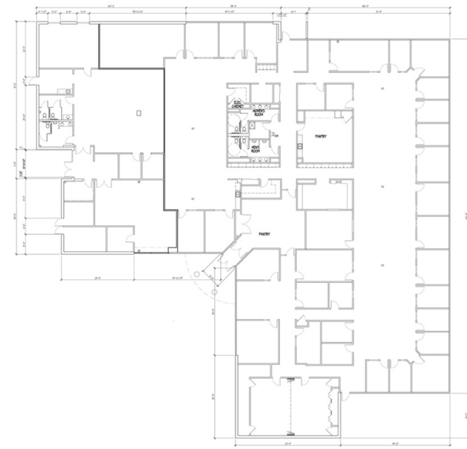
FLOOR PLAN 20,136 SF